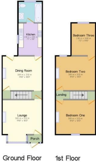
Ground Floor 1st Floor